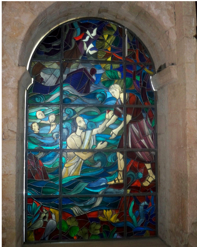
Benedictine monastery window